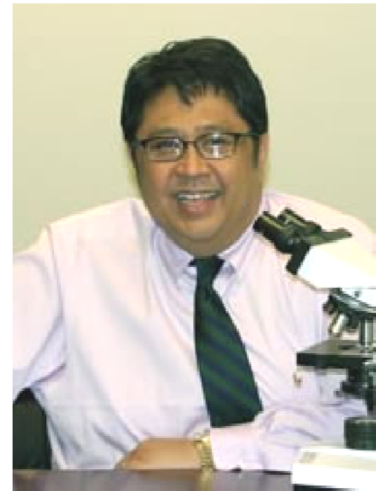
Board certified allergist, pollen counter, asthma educator